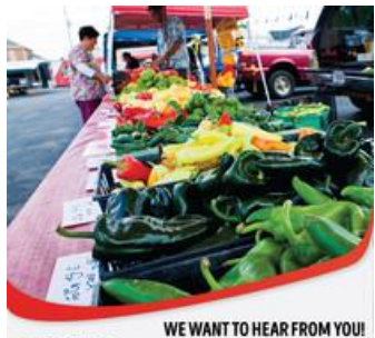
Indiana Farm Bureau Take a five-minute survey for your chance to win a $150 gift card

Please take this <u>five-minute survey</u> for your change to win a $150 gift card from Indiana Farm Bureau!